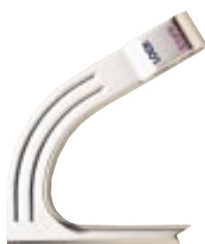
Insertion Handle 359.052