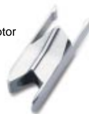
Removal Adaptor 359.086S