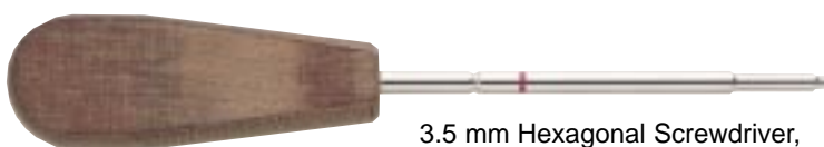
3.5 mm Hexagonal Screwdriver, self-retaining 314.271