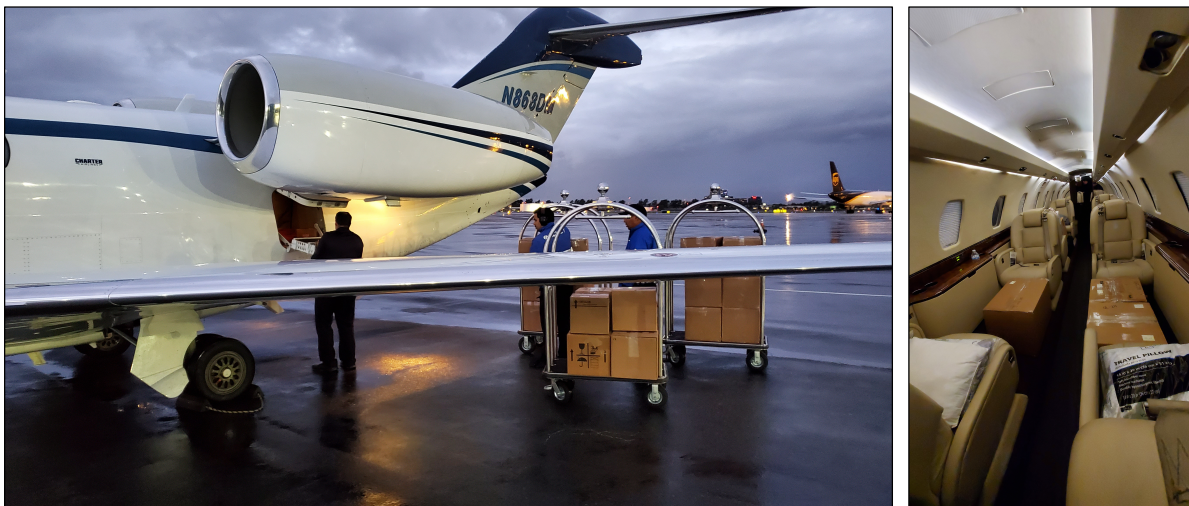
Unloading ventilators in New Jersey, U.S.A. in March 2020.