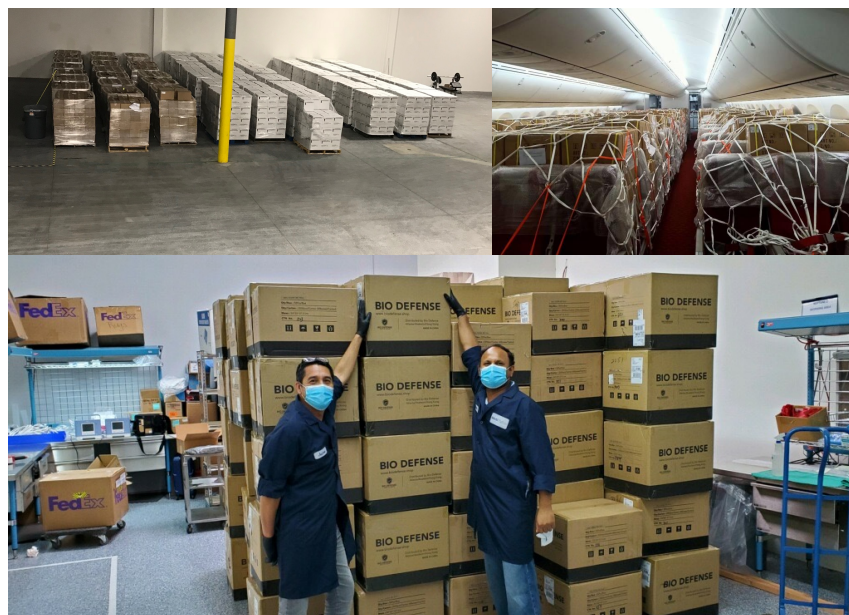
Top left: Inventory of Hand Sanitizer during late April. Top Right: The best way to get product over internationally is to sometimes buy out passenger seats on commercial flights! Bottom: Happy to receive product!